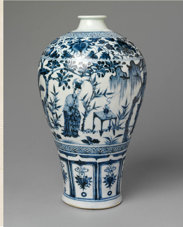
VASE, UNKNOWN MAKER, 1320 -1350, JINGDEZHEN, CHINA.