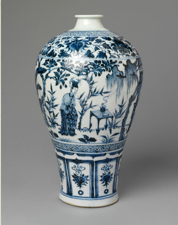
Vase, unknown maker, 1320 –13 50, Jingdezhen, China.