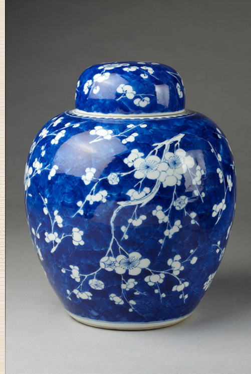
Ginger jar, unknown maker, 1683 – 1710, Jingdezhen, China.